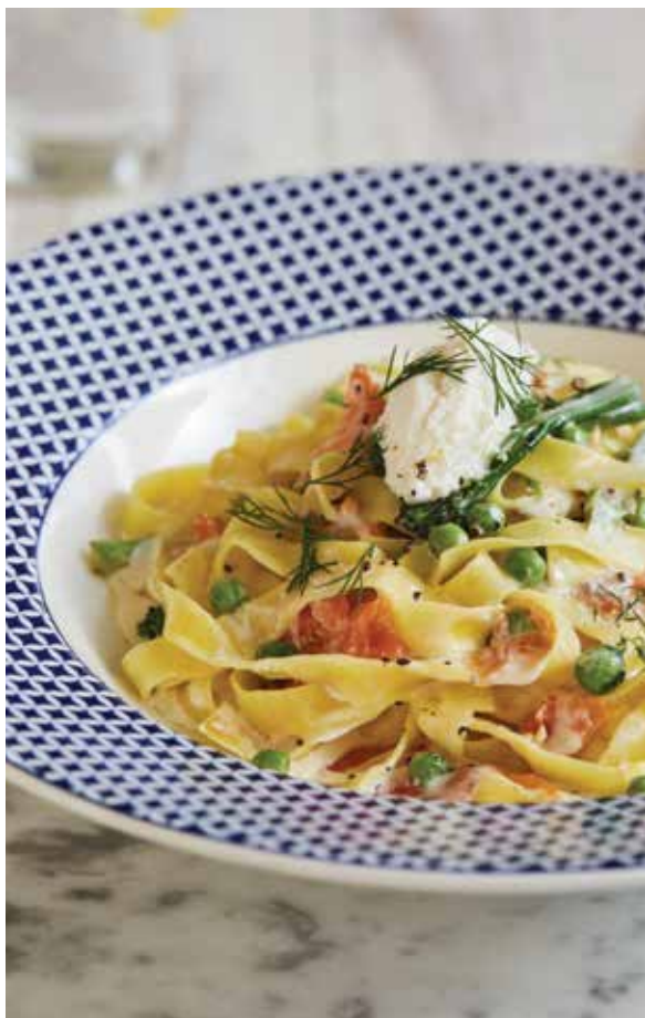
SMOKED SALMON FETTUCCE