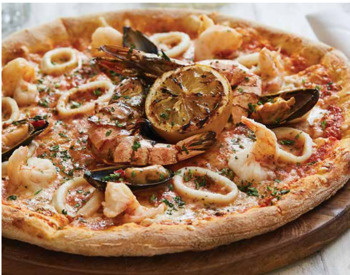
FRUTTI DI MARE