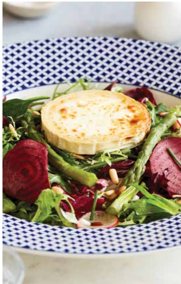
GOAT'S CHEESE AND BEETROOT SALAD